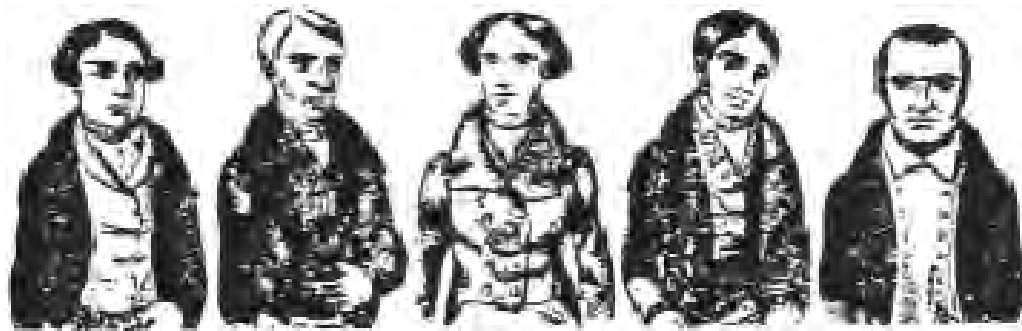
The Tolpuddle Martyrs

We will bring them home, we will bring them home, From the claws of the mighty, with their hearts of stone. We will bring them home, we will bring them home, We'll reach out across the ocean, and we'll bring them home.